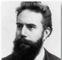
In 1895, Wilhelm Conrad Roentgen discovers the X ray.