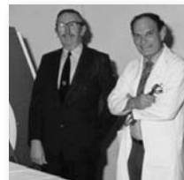
In 1972, Sir Godfrey Hounsfield and Dr. Alan Cormack invent the CT Scan.