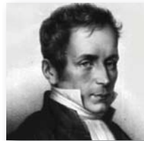
In 1816, Rene' Laennec introduces the first stethoscope.