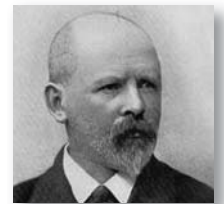
In 1881, Samuel Siegfried Karl Ritter von Basch invents the sphygmomanometer to determine blood pressure.