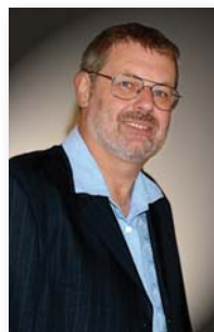
And, in 1994, Rolf Binder introduces ONDAMED - Specific PEMF technology centered around Pulse Biofeedback.

ONDAMED is a gentle, highly effective approach to bringing physiological balance to the entire body. Safe, efficient and fast acting, it is the method of choice for the most challenging medical issues. We have always known that every patient is different, and that every patient wants to be treated as an individual rather than