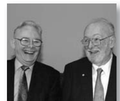
In 1975, the MRI technique is born.